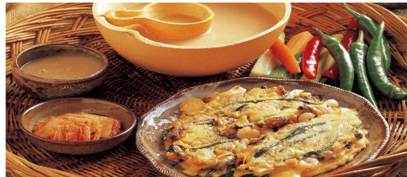
Pajeon and Makgeolli

National parks are very rarely within a city, and yet Bukhansan Mountain in Seoul was designated as the 15th national park of Korea in 1983. The national park is like an ecological island because it's totally surrounded by urban areas. It's a popular natural park for over 20 million residents within the vicinity. There are also many historical and cultural sites including Bukhansanseong Fortress with over 2,000 years of history, over 100 Buddhist temples and monk's cells. This hiking route starts at Bamgol park ranger post. You will climb the Bagundae peak through the hidden wall ridge, then walk down the trail that leads you to Bukhansan mountain fortress wall and over at the Bukhansansung park ranger post.