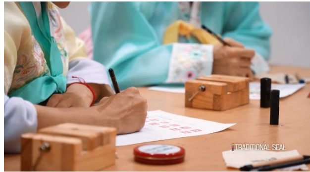
Seal Making Experience

The name seal or stamp is called a Dojang. A dojang is a stamp made from stone, wood, ivory or precious metals that displays the signature of the owner. Nowadays, you're most likely to only see ones made from rock. Experience the traditional culture of Korea by engraving your own stone stamp (seal engraving). Create your own Korean-style stamp that can be used in real life! It will be an unforgettable experience.