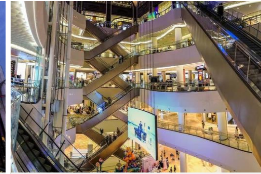
Lotte World Shopping Mall

SEOUL SKY is located on floors 117-123 of Lotte World Tower, the nation's tallest and the world's fifth tallest building. The observatory offers a panoramic view of the entire capital city, beautiful both day and night. SEOUL SKY is comprised of an exhibition zone, observation deck, sky deck, dessert cafe, sky terrace, lounge, and more.