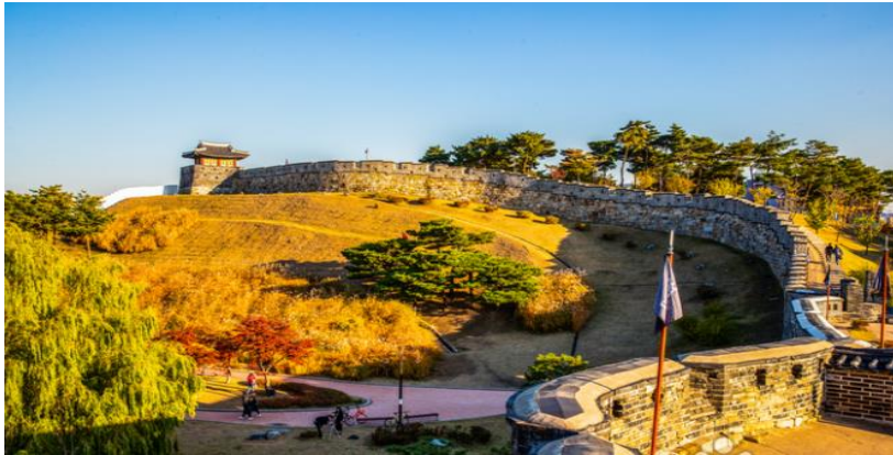
Suwon Fortress (World Heritage)

Suwon was one of four main regional government centers during the Joseon dynasty. Hwaseong Fortress, built to protect the city, was designated as a UNESCO World Cultural Heritage Site on December 12, 1997 for its historical value. The fortress offers various performances daily as well as the Suwon Hwaseong Cultural Festival every fall. The walls stretch for 5,700 kilometers, with Paldalsan Mountain at the center. The fortress, constructed from 1794 to 1796, was built as a display of King Jeongjo's filial piety towards his father and to build a new pioneer city with its own economic power.