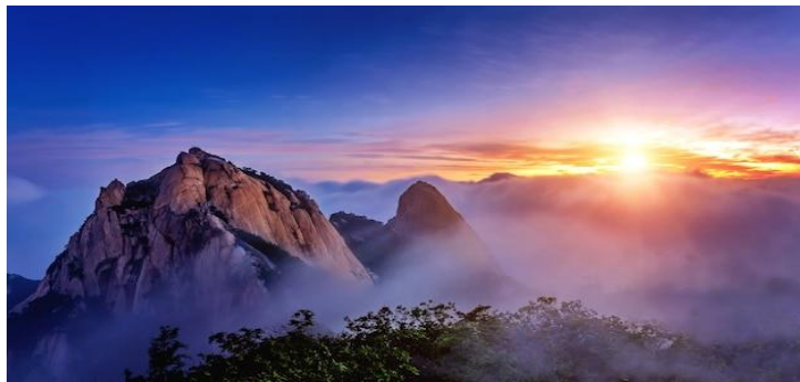
Mt. Bukhansan National Park

National parks are very rarely within a city, and yet Bukhansan Mountain in Seoul was designated as the 15th national park of Korea in 1983. The national park is like an ecological island because it's totally surrounded by urban areas. It's a popular natural park for over 20 million residents within the vicinity. There are also many historical and cultural sites including Bukhansanseong Fortress with over 2,000 years of history, over 100 Buddhist temples and monk's cells. This hiking route starts at Bamgol park ranger post. You will climb the Bagundae peak through the hidden wall ridge, then walk down the trail that leads you to Bukhansan mountain fortress wall and over at the Bukhansansung park ranger post.