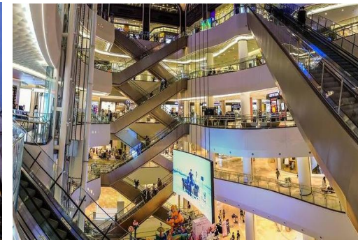
Lotte World Shopping Mall

SEOUL SKY is located on floors 117-123 of Lotte World Tower, the nation's tallest and the world's fifth tallest building. The observatory offers a panoramic view of the entire capital city, beautiful both day and night. SEOUL SKY is comprised of an exhibition zone, observation deck, sky deck, dessert cafe, sky terrace, lounge, and more.