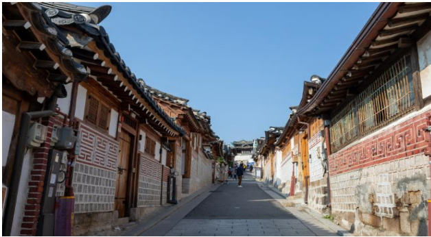
Bukchon Hanok Village

Surrounded by Gyeongbokgung Palace, Changdeokgung Palace and Jongmyo Shrine, Bukchon Hanok Village is home to hundreds of traditional houses, called hanok, that date back to the Joseon dynasty. The name Bukchon, which literally translates to "northern village," came about as the neighborhood lies north of two significant Seoul landmarks, Cheonggyecheon Stream and Jongno. Today, many of these hanoks operate as cultural centers, guesthouses, restaurants and tea houses, providing visitors with an opportunity to experience, learn and immerse themselves in traditional Korean culture.