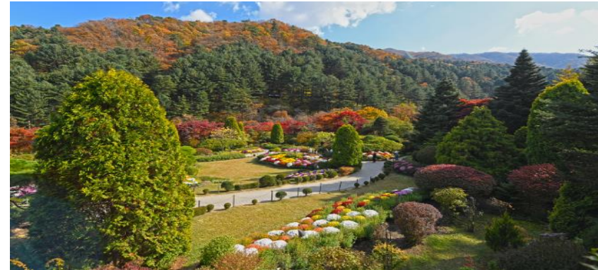
The Garden of Morning Calm

Nami Island, with the concept of “Fairy Tale Village and Song Village,” provides various cultural events, concerts, exhibitions, and more to give children dreams and hopes, couples' love and memories, and artists a space for creativity. Tourists can enjoy facilities including Song Museum, Picture Book Playground, MICE Center, and various activities such as Charity Train, Story Tour Bus, Bicycle, etc. Restaurants provide delicious food with carefully selected local ingredients and Hotel Jeonggwangru themed accommodations.