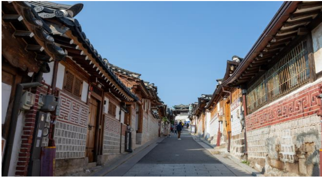
Bukchon Hanok Village

Surrounded by Gyeongbokgung Palace, Changdeokgung Palace and Jongmyo Shrine, Bukchon Hanok Village is home to hundreds of traditional houses, called hanok, that date back to the Joseon dynasty. The name Bukchon, which literally translates to "northern village," came about as the neighborhood lies north of two significant Seoul landmarks, Cheonggyecheon Stream and Jongno. Today, many of these hanoks operate as cultural centers, guesthouses, restaurants and tea houses, providing visitors with an opportunity to experience, learn and immerse themselves in traditional Korean culture.