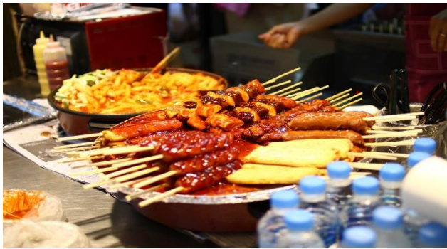
Myeongdong street food

Myeongdong is not only Seoul's shopping mecca, it is also a street food paradise for food lovers. The pedestrian-friendly streets are lined with rows of fabulous Korean street food. You may need a few visits (and cash only) to try out most of the popular street food at Myeongdong. Every visit to Myeongdong is often with much anticipation and excitement to check out your favourite food stalls, new stalls that may have sprung out since your last visit and seasonal food stalls like roasted sweet potatoes and pumpkin soup available only during winter. Traditional Korean street food includes tteokbokki, chicken skewers and Korean hotteok.