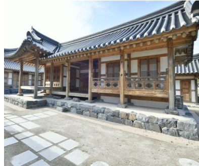
Nonsan Hanok Village

Yangji Seodang is a traditional Seodang located in Songjeong-ri, Yeonsan-myeon, Nonsan-si, Chung-cheongnam-do. Seodang were private village schools providing elementary education during the Goryeo and Joseon dynasties of Korea.