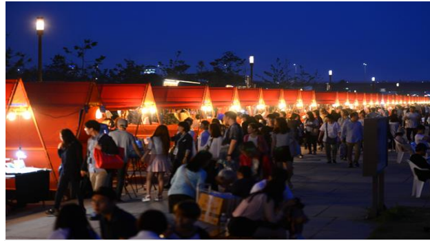
Cheongyecheon Bamdokkaebi Night Market

Myeongdong is not only Seoul's shopping mecca, it is also a street food paradise for food lovers. The pedestrian-friendly streets are lined with rows of fabulous Korean street food. You may need a few visits (and cash only) to try out most of the popular street food at Myeongdong. Every visit to Myeongdong is often with much anticipation and excitement to check out your favourite food stalls, new stalls that may have sprung out since your last visit and seasonal food stalls like roasted sweet potatoes and pumpkin soup available only during winter. Traditional Korean street food includes tteokbokki, chicken skewers and Korean hotteok.