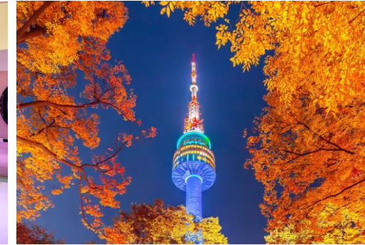
N Seoul Tower

HiKR Ground is a tourism promotion center that utilizes K-pop experience and media art and is operated by Korea Tourism Organization's Seoul Center. The name HiKR combines "Hi from KoRea" and aims to provide a playground for global travelers. In particular, the various tourism content appeals to Millennials and Gen Z.