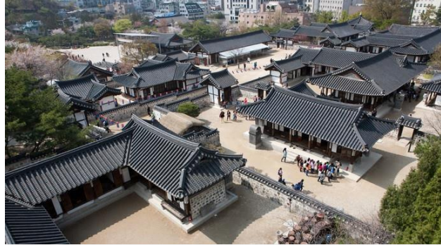
Namsan Hanok Village

Gwangjang Market was the first permanent market in Korea and continues to thrive as a popular tourist destination today. The name Gwangjang means "to gather from afar and keep altogether." The market began as a small trading center that brought in goods from nearby regions, but has now grown into a large wholesale market selling a variety of goods, including upholstery, imported goods, groceries, dried fish, traditional goods, and more.