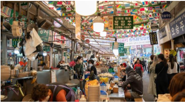
Gwang Jang Traditional Market

Gwangjang Market was the first permanent market in Korea and continues to thrive as a popular tourist destination today. The name Gwangjang means "to gather from afar and keep altogether." The market began as a small trading center that brought in goods from nearby regions, but has now grown into a large wholesale market selling a variety of goods, including upholstery, imported goods, groceries, dried fish, traditional goods, and more.