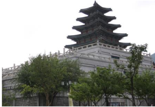
The National Folk Museum

Gyeongbok Palace is the oldest palace among the five Grand Palaces in Seoul and a palace that represents the Joseon Dynasty, boasting a large and magnificent scale as well as architectural beauty.