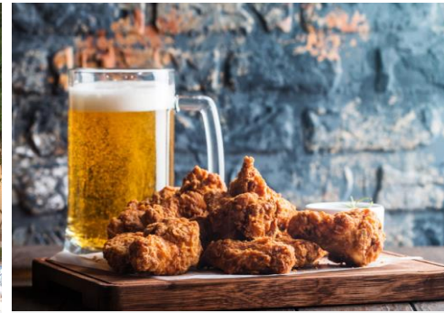
Chicken & Beer

There's something about drinking beer and eating fried food that really hits the spot. And in South Korea, beer and fried chicken go so well together that this combo has developed into a national favorite with its own name: chimaek (치맥). The word chimaek is the result of combining CHiKin (chicken) and MAEKju (Korean for beer). While the consumption of the two has been around for decades, the term's popularity soared during the 2010 World Cup when fans would enjoy chimaek as they watched games.