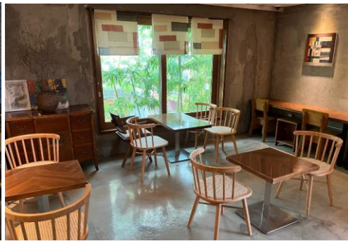
BTS's Café HUGA

Starfield COEX Mall, located at the center of Seoul, leads in trend and culture. Combining fashion, food, culture and entertainment, the mall provides everything the visitors need. The Starfield Library offers a space to rest and entertainment with books.