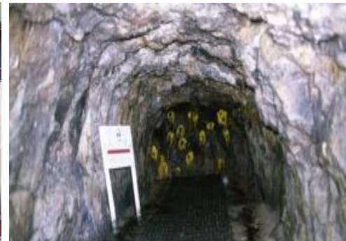
The 3 rd Infiltration Tunnel

DMZ Theater & Exhibition Hall is a place where you can watch a video which explains about the 3 rd tunnel and other tunnels as well as history of the division of Korea.