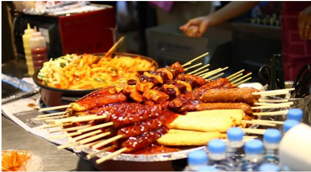
Myeongdong street food

Myeongdong is not only Seoul's shopping mecca, it is also a street food paradise for food lovers. The pedestrian-friendly streets are lined with rows of fabulous Korean street food. You may need a few visits (and cash only) to try out most of the popular street food at Myeongdong. Every visit to Myeongdong is often with much anticipation and excitement to check out your favourite food stalls, new stalls that may have sprung out since your last visit and seasonal food stalls like roasted sweet potatoes and pumpkin soup available only during winter. Traditional Korean street food includes tteokbokki, chicken skewers and Korean hotteok.