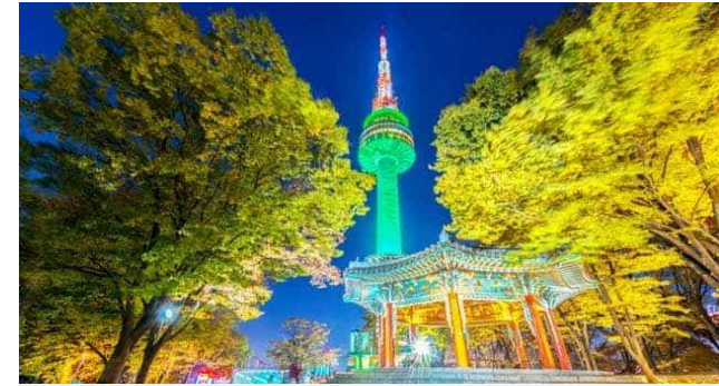
Seoul N Tower (Cable)

The metropolitan city Seoul presents Seoul Bamdokkaebi Night Market for your fun evening out (except when freezing Korean winters have their time). With its huge success year by year since 2015, Seoul Bamdokkaebi Night Market has become a go-to place to relish the evening breeze and some new trends. It's impossible to imagine Seoul Bamdokkaebi Night Market without a dazzling array of food trucks! Some menus may overlap between a couple of trucks, but mostly they serve various international foods to try. Choose your pick as your stomach tells you! Cash and card both are accepted for payment.