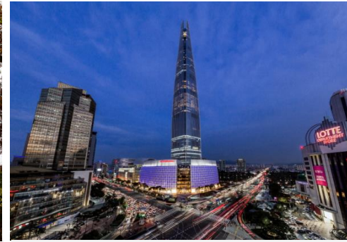
Seoul Sky Observatory

Namsan Seoul Tower was the first multipurpose tower to be established in Korea, effectively incorporating a sightseeing observatory to a broadcasting tower. For the past 40 years, Namsan Seoul Tower has served as an iconic landmark of Korea and a representative tourist attraction. The tower's observatory offers an unobstructed view of the whole city, allowing it to become one of the all-time favorite attractions of Seoul citizens as well as domestic and international tourists.