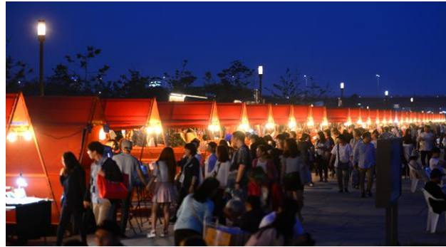
Cheonggyecheon Bamdokkaebi Night Market

Myeongdong is not only Seoul's shopping mecca, it is also a street food paradise for food lovers. The pedestrian-friendly streets are lined with rows of fabulous Korean street food. You may need a few visits (and cash only) to try out most of the popular street food at Myeongdong. Every visit to Myeongdong is often with much anticipation and excitement to check out your favourite food stalls, new stalls that may have sprung out since your last visit and seasonal food stalls like roasted sweet potatoes and pumpkin soup available only during winter. Traditional Korean street food includes tteokbokki, chicken skewers and Korean hotteok.