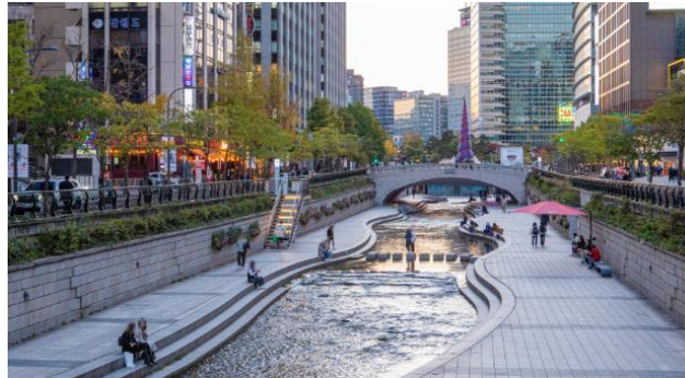
Pass by Cheonggye Stream

Surrounded by Gyeongbokgung Palace, Changdeokgung Palace and Jongmyo Shrine, Bukchon Hanok Village is home to hundreds of traditional houses, called hanok, that date back to the Joseon dynasty. The name Bukchon, which literally translates to "northern village," came about as the neighborhood lies north of two significant Seoul landmarks, Cheonggyecheon Stream and Jongno. Today, many of these hanoks operate as cultural centers, guesthouses, restaurants and tea houses, providing visitors with an opportunity to experience, learn and immerse themselves in traditional Korean culture.