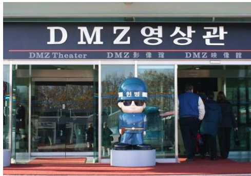
DMZ Theater & Exhibition hall

You can look at meaningful facilities related to the Korean War, such as the Freedom Bridge restored to exchange prisoners during the Korean War, the Gyeongui Line steam locomotive that was shot by 1,020 bullets and left in the DMZ, and the Unification Pond modeled after the Korean Peninsula.