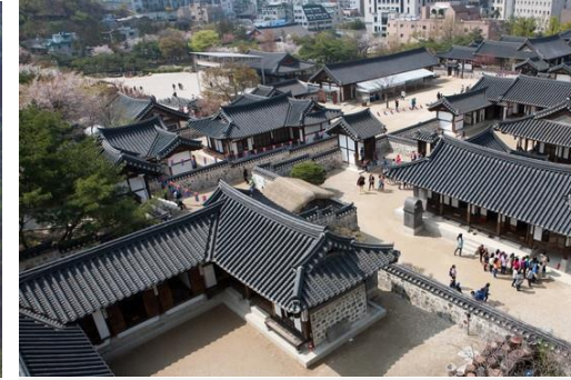
Namsan Hanok Village

The signature markings of the Presidential Residence of Cheong Wa Dae are its blue tiles on the Main Office; it is the first thing to catch one's attention upon viewing the premises. Approximately 150 thousand tiles compose the roof of the Main Office. Each tile was baked individually to make them strong enough to last for hundreds of years.