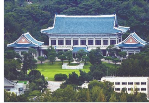
Prior Presidential House

Located inside Gyeongbokgung Palace, the National Folk Museum of Korea presents historical artifacts that were used in the daily lives of Korean people in the past. Through the displays, visitors can learn about the domestic and agricultural lifestyles, as well as Korea's cultural beliefs. The National Folk Museum of Korea has three permanent exhibitions and two special exhibitions as well as a library, souvenir shop, and other subsidiary facilities.