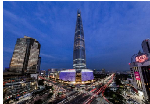
Seoul Sky Observatory

This cafe is a renovated BTS dorm. It is a place full of traces of ARMY as well as BTS' dorm, and it is famous for BTS salt bread. It is a complex cultural space where you have to visit not only the place of BTS fans, but also a beautiful cafe with various exhibition of talented artists.