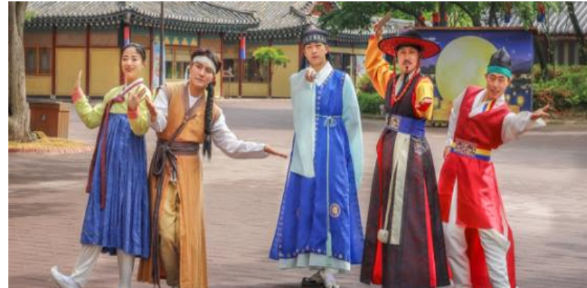
Korean Folk Village

Suwon was one of four main regional government centers during the Joseon dynasty. Hwaseong Fortress, built to protect the city, was designated as a UNESCO World Cultural Heritage Site on December 12, 1997 for its historical value. The fortress offers various performances daily as well as the Suwon Hwaseong Cultural Festival every fall. The walls stretch for 5,700 kilometers, with Paldalsan Mountain at the center. The fortress, constructed from 1794 to 1796, was built as a display of King Jeongjo's filial piety towards his father and to build a new pioneer city with its own economic power.