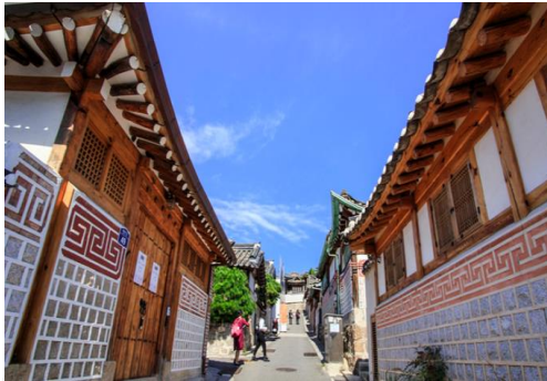
Bukchon Hanok Village

Surrounded by Gyeongbokgung Palace, Changdeokgung Palace and Jongmyo Shrine, Bukchon Hanok Village is home to hundreds of traditional houses, called hanok, that date back to the Joseon dynasty. The name